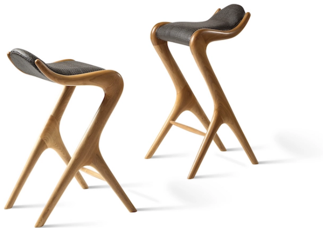
Holly Hunt's Sculpted Saddle seat is a contemporary stool with hand-carved walnut legs and a supportive fabric or leather seat that mimics the ergonomic shape of a Western or English riding saddle and embraces the sculptural nature of classic Kagan designs. It is available in a bar and a counter-height version.